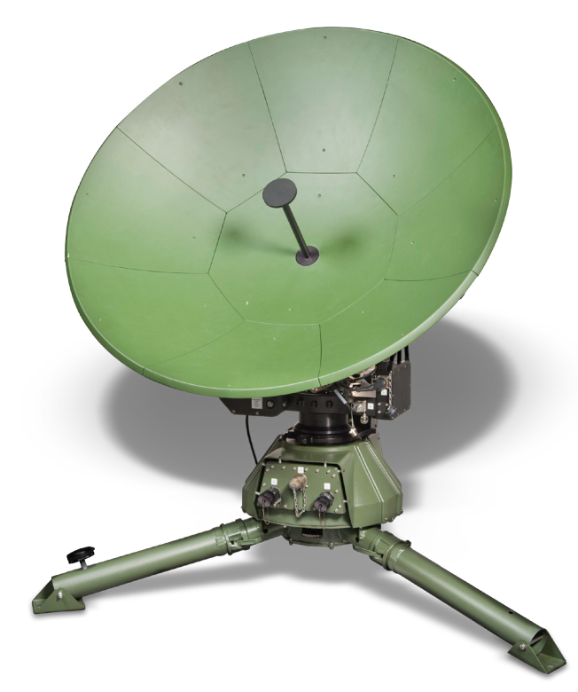
Lightweight C100F Antenna The C100F antenna system is a multi-configurable antenna that will fit a variety of applications/ deployment scenarios.

The various configurations result in a lightweight and packable antenna product with superior stiffness and high performance. The unique optical shape and accurate composite reflector surface provide superior sidelobe and excellent cross-polarization performance. The tripod pedestal and configurable tilt leg allow for a level deployment, even on slopes up to 30°. High performance and repeatability is maintained with precision registration of the nine-piece reflector segments and RF components. The antenna can be quickly assembled by one person in less than 15 minutes. The auto-acquire controller can find the correct satellite and optimize co-pol and crosspol performance with the push of a button. The antenna is configured and controlled using a Web based interface, accessible from the laptop in the RBM unclassified enclave. Using the intuitive graphical user interface, this allows an operator to quickly deploy or stow the antenna and, with only one button press, acquire a particular satellite defined in its configurable database. In addition, this software provides a spectrum analyzer that can be used to verify the signal characteristics without the need for additional, expensive test equipment.